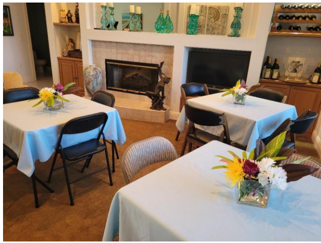
Serenoa Block Party – October 15, 2022